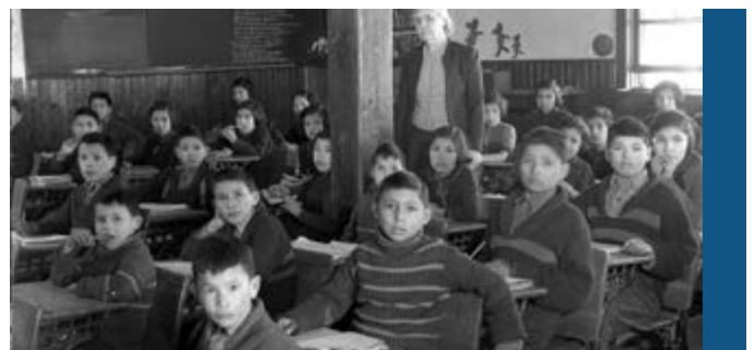
Cree students at their desks with their teacher in a classroom, All Saints Indian Residential School, Lac La Ronge, Saskatchewan, March 1945